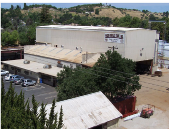
Paso Robles Tank, Inc. Corporate Office

825 26th Street Paso Robles, CA 93446 Phone: (805) 227-1641 Fax: (805) 238-9654