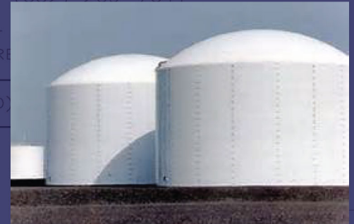
Thermal Energy Storage Tanks