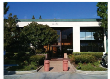
Paso Robles Tank, Inc., Sales

775 E Glendale Ave Sparks, NV 89431 Phone: (775) 525-2862 Fax: (775) 525-2866