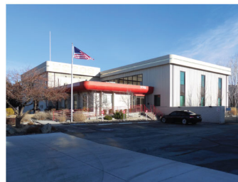
Paso Robles Tank, Inc., Nevada

3883 Wentworth Drive Hemet, CA 92545 Phone: (951) 925-5022 Fax: (951) 925-6822