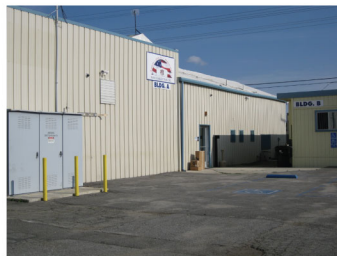
Paso Robles Tank, Inc., Southern California Division

825 26th Street Paso Robles, CA 93446 Phone: (805) 227-1641 Fax: (805) 238-9654